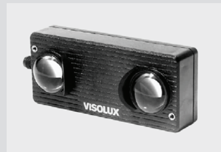
Light scanner type Visolux LT 6000

The sensing range for the light scanners is 0.5 - 6 metres. Also available are new control cables from the sensors to the existing control system (PLC system); revised PLC programme; and updated maintenance and operation manuals.