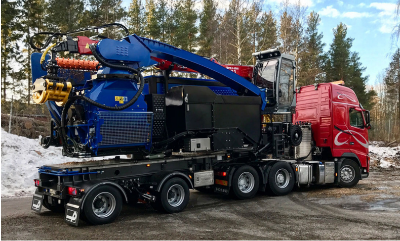
MOBILE CHIPPER 1006.2 ST