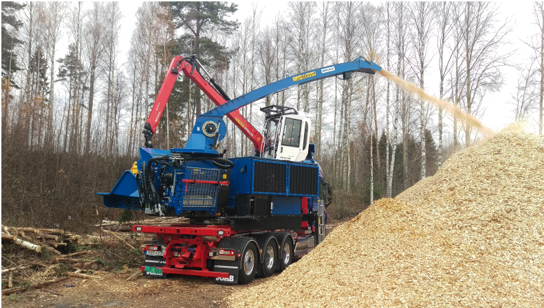
MOBILE CHIPPER 806.3 ST